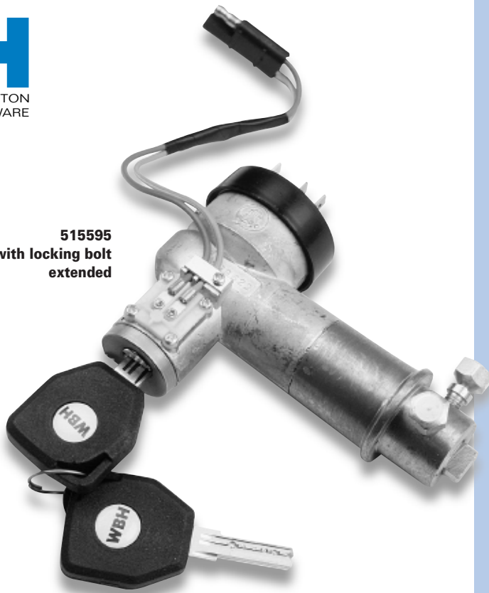
515595 Shown with locking bolt extended