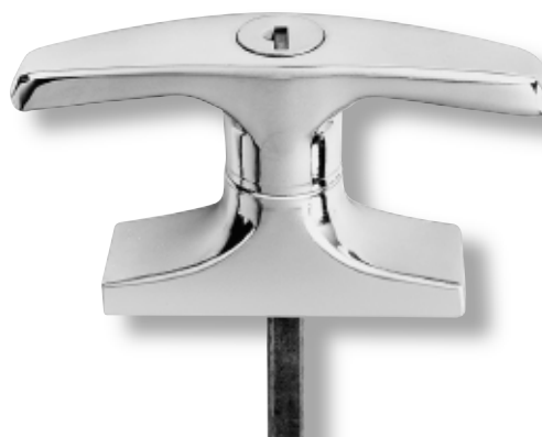
1/24517 Locking 'T' Handle