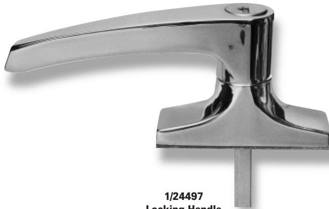
1/24497 Locking Handle