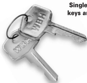
Single-sided 'FS' keys are standard

An older, special design but still popular because of the unusual shape of the handle castings, particularly the deep side-walls and the narrowness of the escutcheon. All fittings are contained above panel surface, making handles fully 'plant-on'. Non-locking models also available.