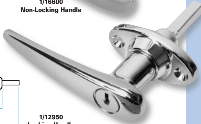
1/12950 Locking Handle