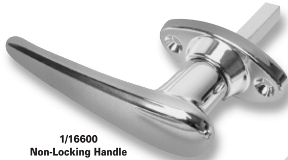
1/16600 Non-Locking Handle