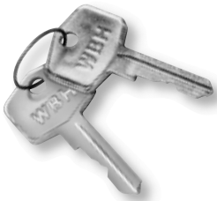
Single-sided 'FS' keys are standard