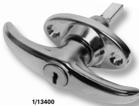
1/13400 Locking 'T' Handle