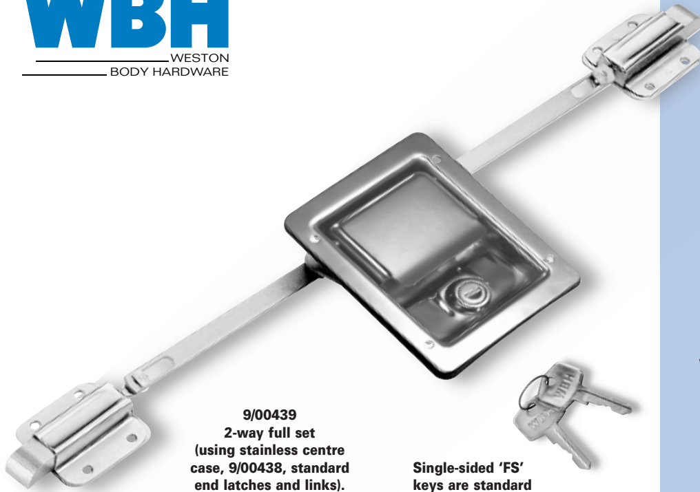
9/00439 2-way full set (using stainless centre case, 9/00438, standard end latches and links).