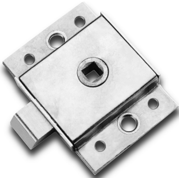
9/02732 with 6.5mm holes & 16mm bolt