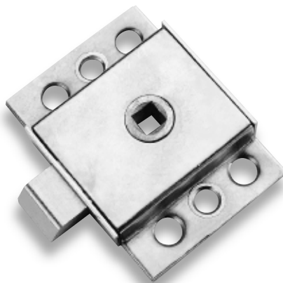
3/17332 with 8mm holes & 16mm bolt