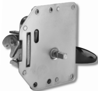
View from outside, with fixed operating shaft