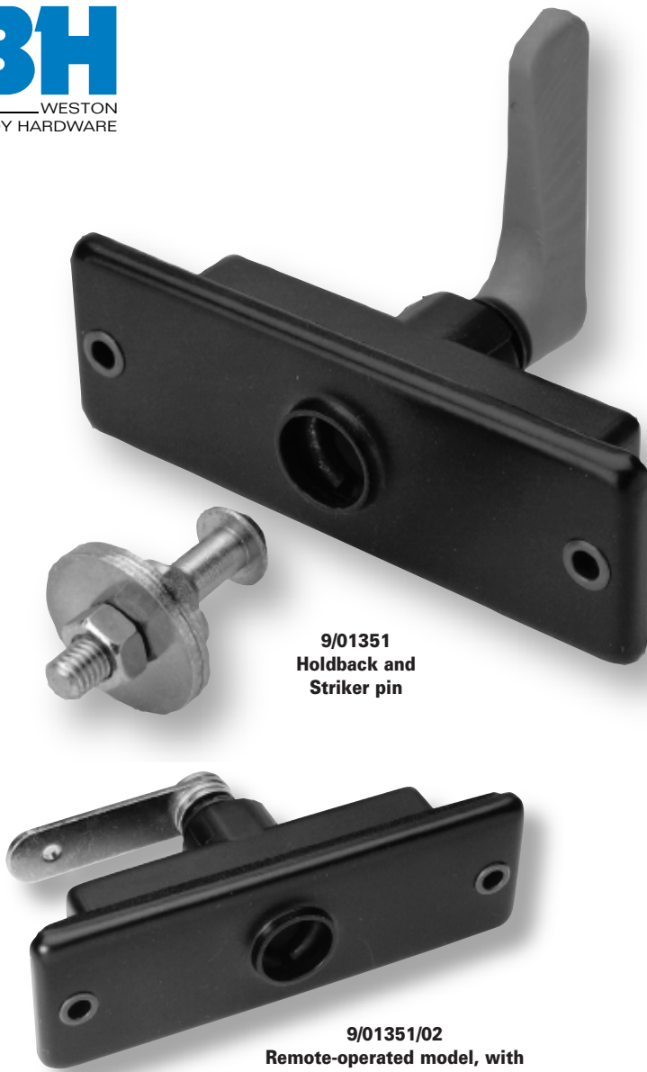
9/01351 Holdback and Striker pin