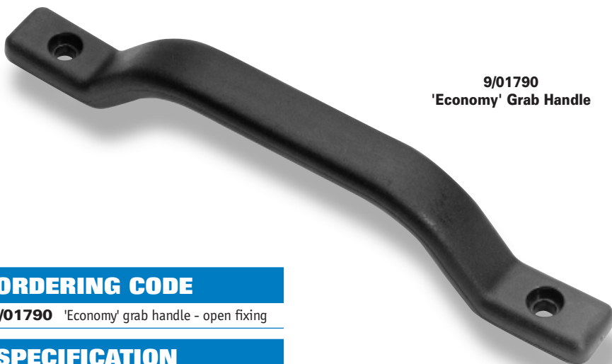
9/01790 'Economy' Grab Handle